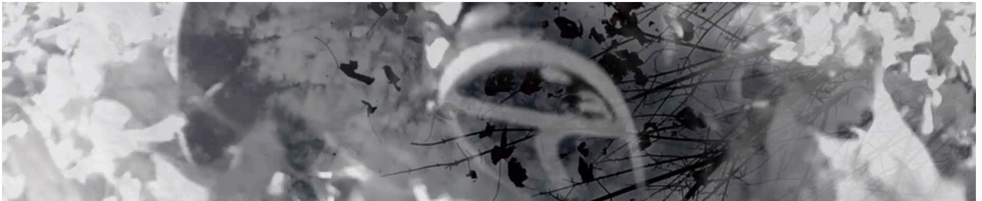
JIMMI TORO – LOVE BELIEVE IT VIDEO SCREEN SHOT

Video – A video is a a digital recording of an image or set of images (such as a movie or animation).