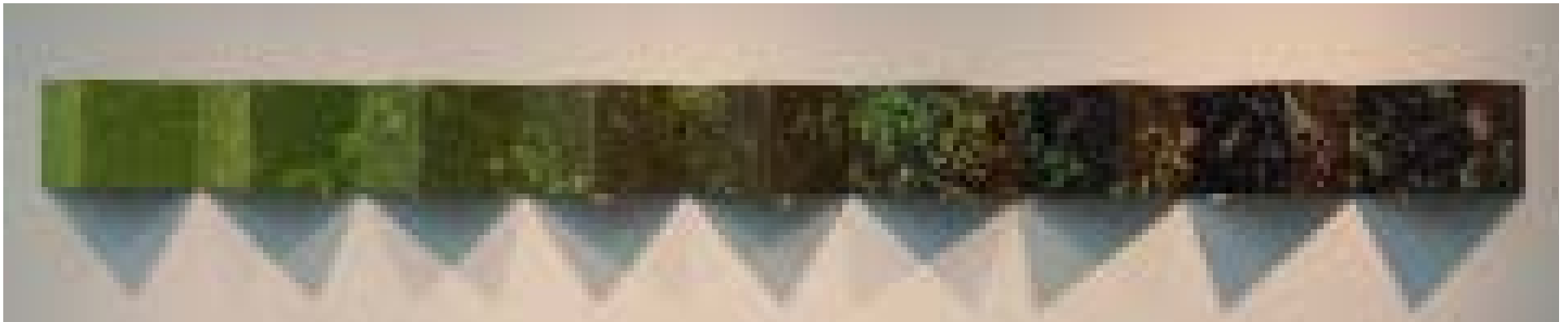
NICOLE PIETRANTONI - GREENS