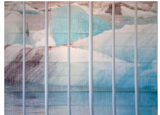
NICOLE PIETRANTONI - IMPLICATIONS