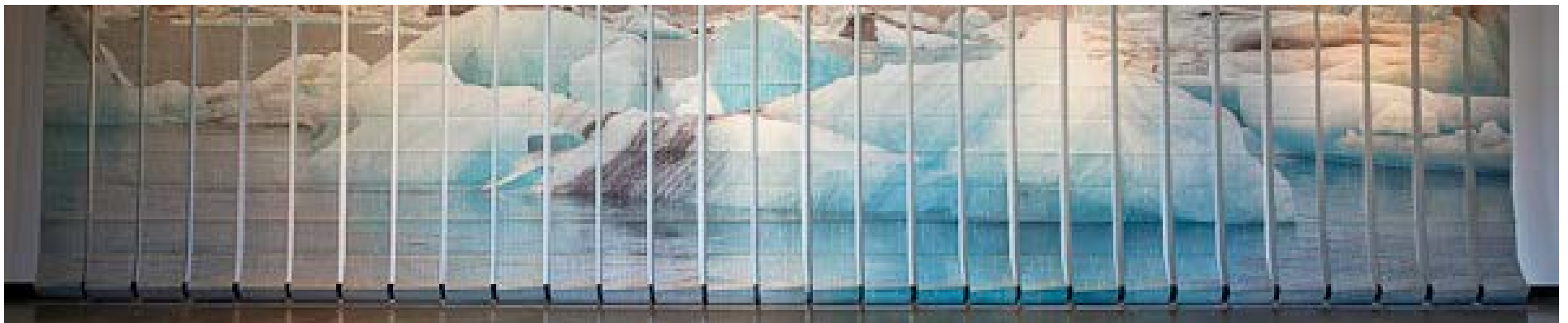
NICOLE PIETRANTONI - IMPLICATIONS

https://nicolekaufman.wordpress.com/2011/04/11/playing-the-ac-cordion/