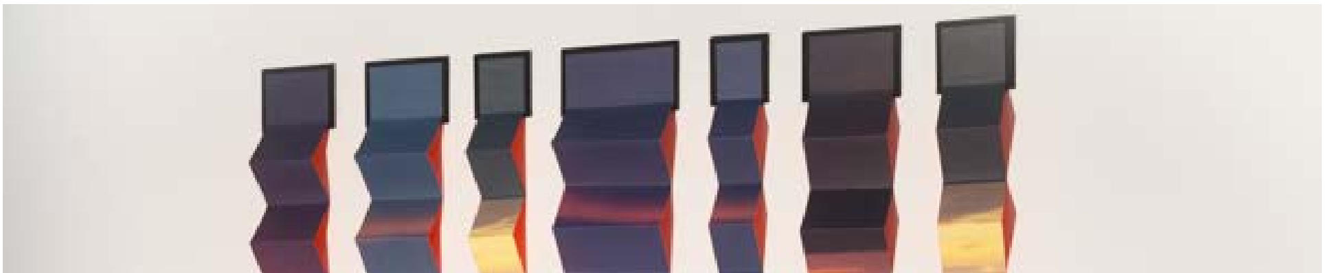
NICOLE PIETRANTONI - SUNSET STRIPS II

6. The accordion books can be displayed horizontally together (showing a more complete historical timeline) or shared as books.