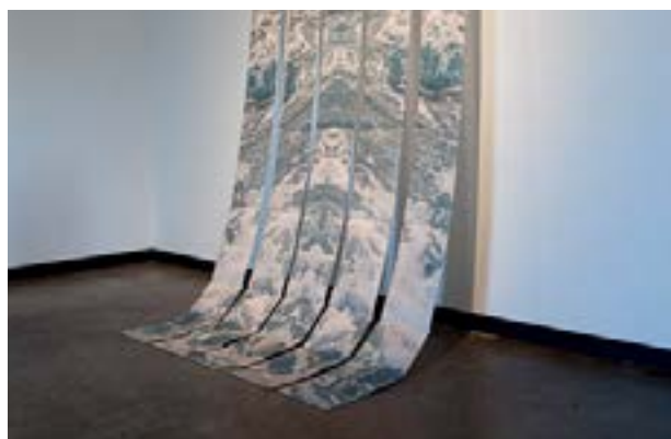
NICOLE PIETRANTONIO - PRECIPITOUS

3. Demonstrate a simple accordion form. Pass out a piece of paper (4 ¼ X 14 in.) Have students follow along step by step while demonstrating in front of the class. To begin,