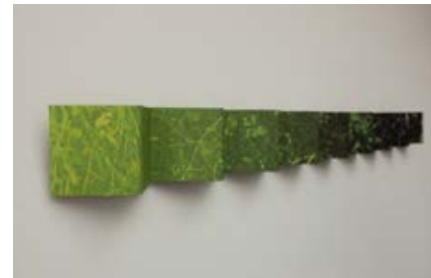
NICOLE PIETRANTONIO - FORCED GREENS