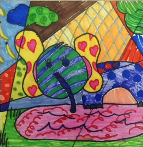
Britto inspired kid artwork