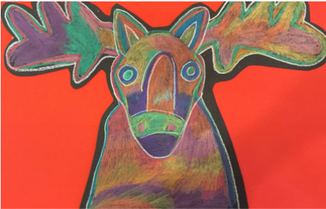
Nieto inspired student art

KEY IDEAS THAT CONNECT TO VISUAL ARTS CORE CURRICULUM: Based on Utah State Visual Arts Core Curriculum Requirements (3rd Grade) Click on links to see more.